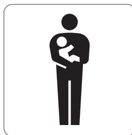
Priority facilities for people accompanied with small children