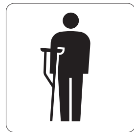
Priority facilities for injured people