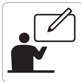
Communication : Writing

Remarks: The text of "English" shown can be replaced as required with another language or national flag.