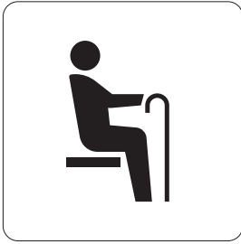
Priority seats for elderly people