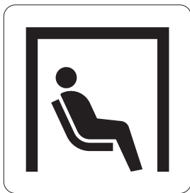
Calm down, cool down

Note 1: Requires supplement text. Use "カームダウン・クールダウン Calm down, cool down".