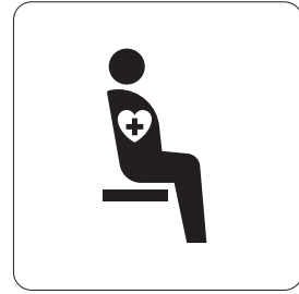
Priority seats for people with internal disabilities, heart pacer, etc.