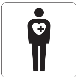
Priority facilities for people with internal disabilities, heart pacer, etc.