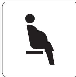
Priority seats for expecting mothers