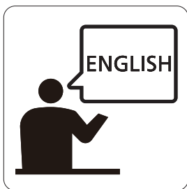
Communication in the specified language

Remarks: The text of "English" shown can be replaced as required with another language or national flag.