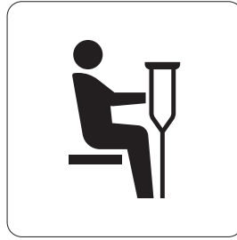
Priority seats for injured people