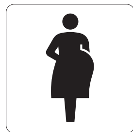
Priority facilities for expecting mothers