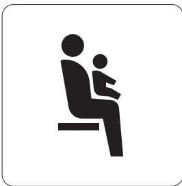
Priority seats for people accompanied with small children