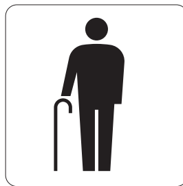
Priority facilities for elderly people

Remarks: It is desirable to display suitable usage instructions, such as "This room is a place to help guests relax when they get anxious in a noisy environment."