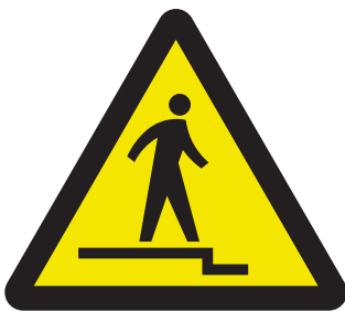
Caution, uneven access / down