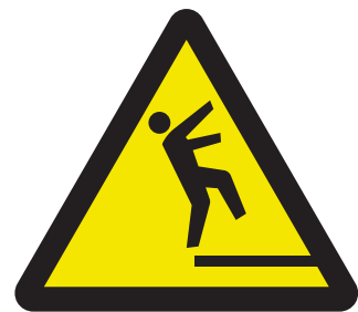
Caution, drop Note 1: Requires supplement text.