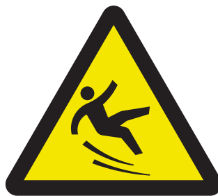
Caution, slippery surface