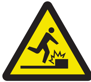
Caution, obstacles Note 1: Requires supplement text.