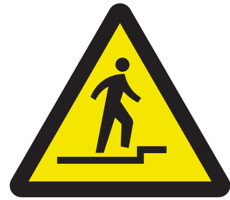
Caution, uneven access / up