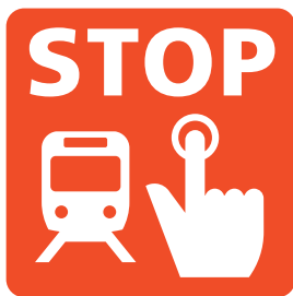
Emergency train stop button