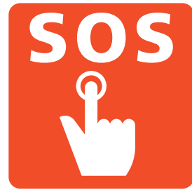
Emergency call button